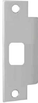
Standard Lip ASA Strike